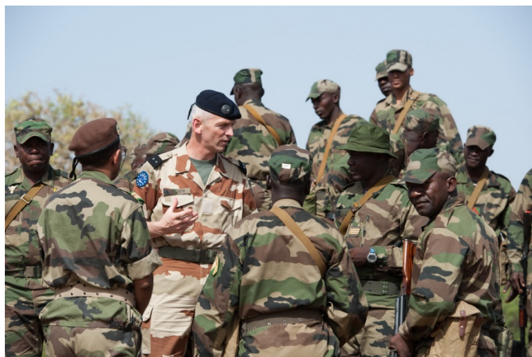
General François Lecointre, commander of the European Union Training Mission in Mali, meets with Malian soldiers in Koulikoro, Mali

In 2013, the United Nations developed an Integrated Strategy for the Sahel, which has three strategic goals: enhance inclusive and effective governance throughout the region; ensure that national and regional security mechanisms are capable of addressing cross-border threats, and integrate humanitarian and development plans and intervention to build long-term resilience. 177 In 2013, ECOWAS drafted a Counter-Terrorism Strategy and Implementation Plan, which has the following objectives: enhance coordination among member states particularly in the fields of intelligence, law enforcement, investigation and the prosecution of terrorist crimes; strengthen national and regional capacities to detect, deter, intercept, and prevent terrorist crimes; promote a criminal justice approach that emphasizes the rule of law, due process, respect for human rights and the protection of civilians in counter-terrorism activities; prevent and combat violent religious radicalism/extremism; harmonize responses to terrorism including counterterrorism legislations; and promote