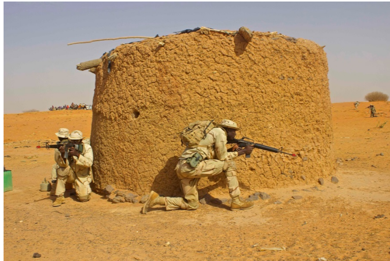
With residents of Marke, Niger, watching from a hilltop at the edge of their village, Senegalese commandos enter the town as part of a “cordon and search” exercise during Flintlock 2014.

Flintlock has taken place in the Sahel since 2006, and has included participation from African, U.S., and European forces, including those of Algeria, Burkina Faso, Chad, Mali, Mauritania, Morocco, Niger, Nigeria, Senegal, South Africa, Canada, Tunisia, Italy, France, Germany, the Netherlands, Spain, and the United Kingdom.