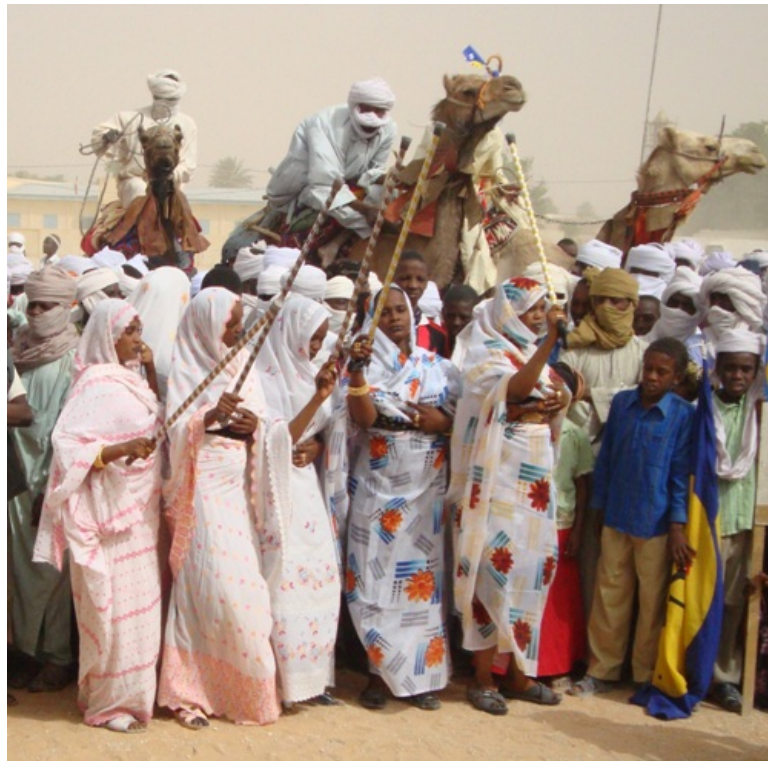
A 2010 cultural festival, funded from the PDEV project, was organized in the desert oasis of Faya Largeau, capital of the