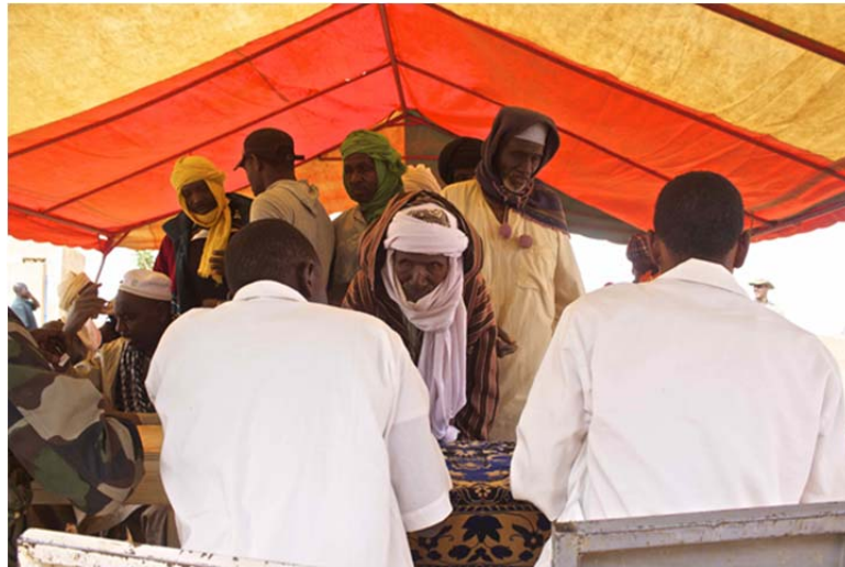
Tuareg and Hausa men sign in to receive medical care at a registration tent outside the medical clinic in Amaloul, Niger.

As a program focused on countering the spread of terrorism and violent extremism in the region, TSCTP was not designed to prevent the succession of crises that Mali has suffered since early 2012. 160 Therefore, attributing TSCTP with the capacity to prevent state collapse in this environment misrepresents the scope and scale of the program. 161 Realistically, a program designed to address the region's structural challenges would have been on the scale of the Marshall Plan or Plan Colombia – with a broader scope that looked more like nation-building than TSCTP's narrow focus on CT/CVE. Such a program would have required a much larger U.S. government commitment across most of the ten TSCTP countries, which would have been unlikely due to U.S. involvement in Iraq and Afghanistan and the fact that the Sahel was not at the forefront of U.S. national security concerns. In reality, by focusing on CT/CVE, TSCTP activities worked at the margins of state weakness – a narrow focus that aligned with the