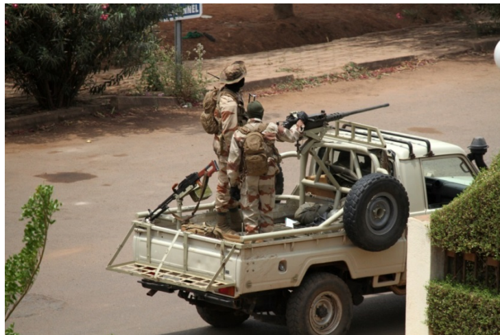
Malian troops stand guard outside Kati Barracks in Bamako,

Several factors have led to disruptions in security and development assistance to TSCTP countries, such as coups (Mauritania in 2008, Niger in 2010, and Mali in 2012); civil wars (Chad in 2008); and poor performance on budget transparency, trafficking in persons, child soldiers, and Leahy vetting. 232 Some of these disruptions meant that according to law, the United States was prohibited from providing non-humanitarian assistance to these countries – except on issues of maternal/child health and counterterrorism – without a presidential waiver. 233 With regard to coups, per Section 7008 of the Department of State Foreign Operations and Related Programs Appropriations Act (SFOAA), no funds appropriated under Titles III-VI of the Act can be obligated to any country whose government has been deposed by a coup. Legally speaking, the United States can continue Title 10 (DoD) security force assistance in the aftermath of an unconstitutional change of government, but such assistance is sometimes suspended on policy grounds. 234