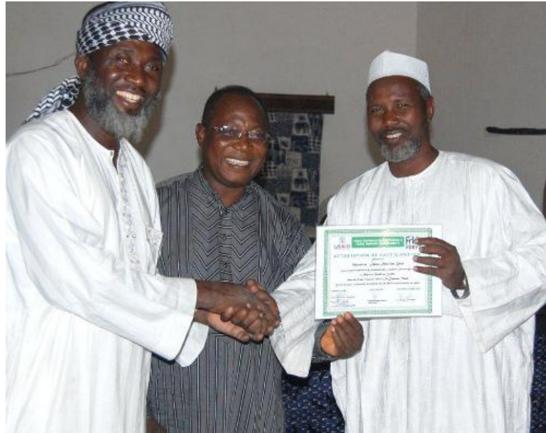
A Chadian imam (right) receives a completion certificate from the two Nigerian clergy, one Muslim and one Protestant, who participated in a five-day workshop to promote interfaith dialogue.