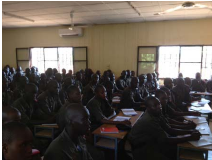
Police cadets attending class at a police academy in Niamey, Niger.

As part of their duties, the RSO facilitates funding for mobility, communications, and equipment, such as the Personal Identification Secure Comparison and Evaluation System (PISCES). PISCES is a biometric database that allows immigration officials to use fingerprints and an electronic scan of passport photos to develop an immigration stop list at international airports and land border crossings in an effort to interdict potential terrorists. 67 The RSO also coordinates classroom- and field-based training courses on topics such as quality control of civil aviation security, border control management, vital installation security, recognition of fraudulent documents, digital forensics investigation, interdiction of terrorist activities, explosives incident countermeasures, canine detection of explosives, hostage negotiation, surveillance detection, and SWAT training. 68