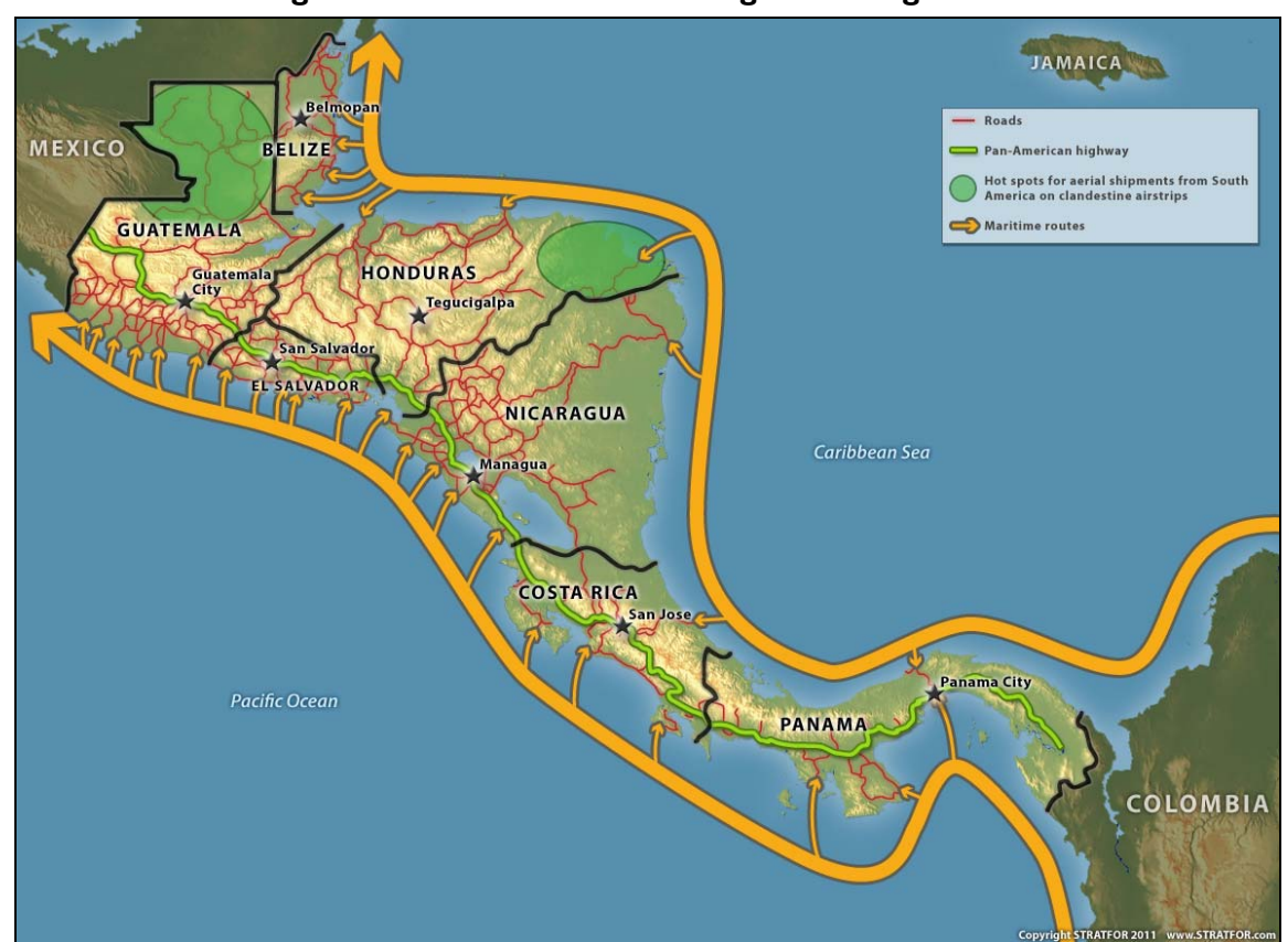
Figure 3. Central American Drug Trafficking Routes

amount of the cocaine that passed through Mexico first transited through Central America. The use of Central America as a transshipment zone has grown, however, as traffickers have used overland smuggling, littoral maritime trafficking, and short-distance aerial trafficking rather than long-range maritime or aerial trafficking to transport cocaine from South America to Mexico.<sup>32</sup> In addition to cocaine, a large but unknown proportion of opiates, as well as foreign-produced marijuana and methamphetamine, some of which is now locally produced, also flows through the same pathways (see Figure 3 ). Currently, more than 80% of the primary flow of cocaine trafficked to the United States transits Central America.<sup>33</sup> This overwhelming use of the Central America-Mexico corridor as a transit zone represents a major shift in trafficking routes. In the 1980s and early 1990s, drugs primarily transited through the Caribbean into South Florida.