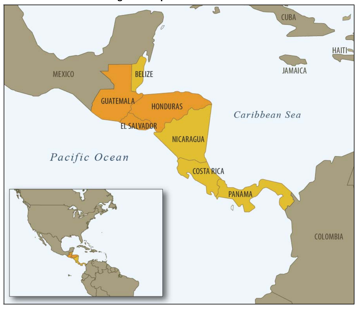
Figure 1. Map of Central America