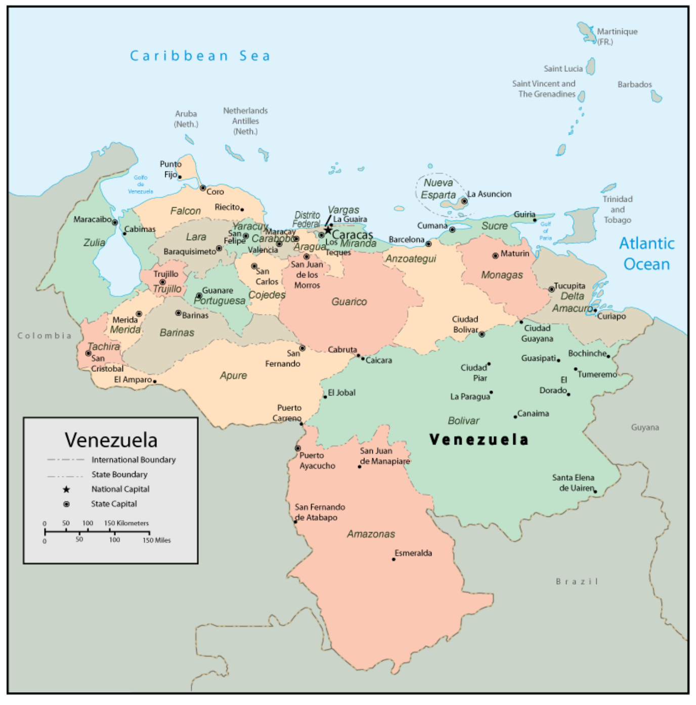
Figure I. Map of Venezuela