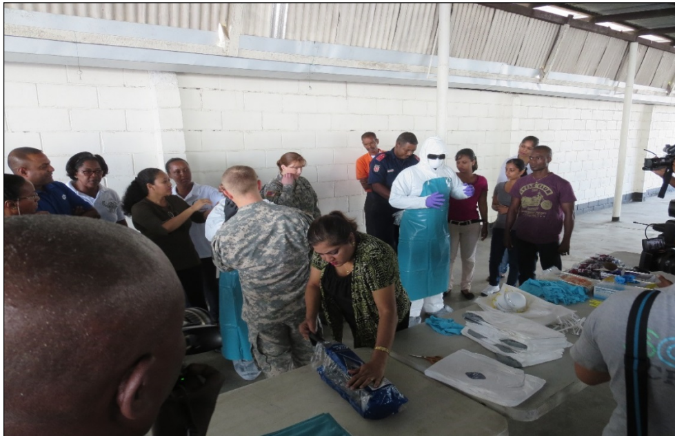
Members of the Suriname National Coordination Center for Disease (NCCR) learn best practices in infectious disease response from members of the South Dakota National Guard.

At the request of the President of Suriname, Desi Bouterse, the South Dakota NG discussed best practices in responding to an infectious disease outbreak with the National Coordination Center for Disaster Response (NCCR) of Suriname. The information exchange demonstrated how to wear, use, and effectively dispose of personal protective equipment in the event of Ebola contamination in Suriname. The SPP event helped ensure that Suriname would be a regional leader in infectious disease preparedness. The National Guard was the partner of choice for this type of activity in USSOUTHCOM due to its unique set of skills and experience engaging with civilian disaster response organizations.