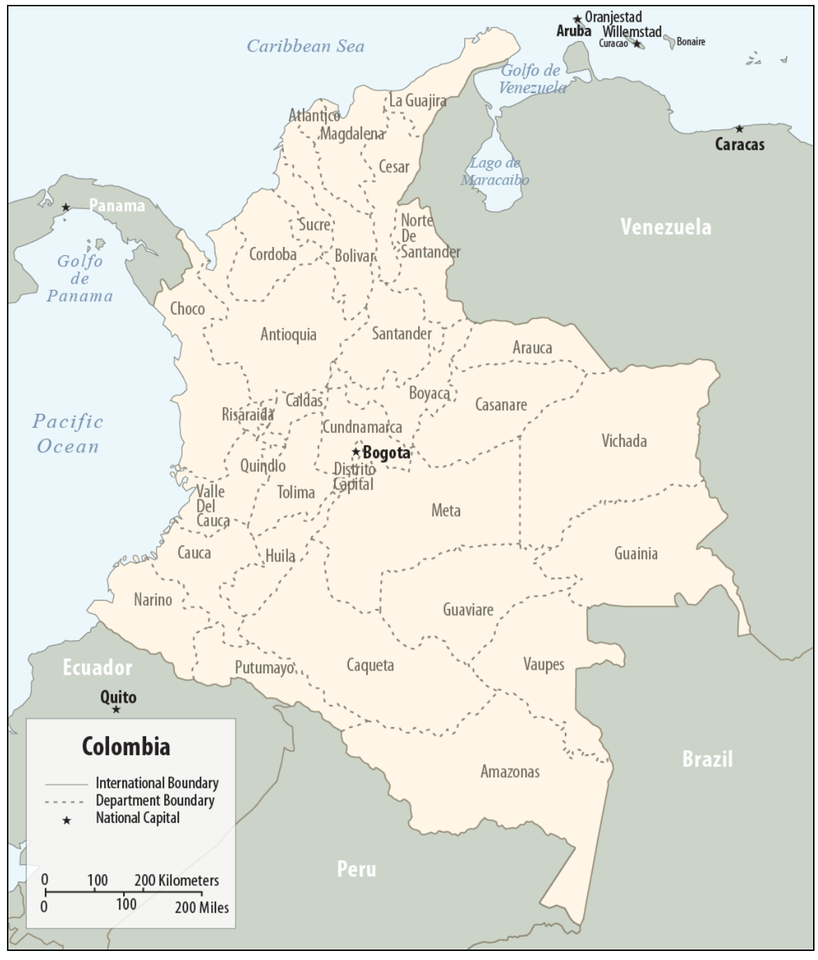
Figure 1. Map of Colombia Showing Departments and Capital