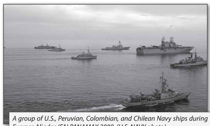
Fuerzas Aliadas (FA) PANAMAX 2008.

Building confidence, capability, and cooperation among partners is essential to confronting today's security challenges. Our exercise Fuerzas Aliadas (Allied Forces) PANAMAX has matured over the last five years and has become one of our flagship