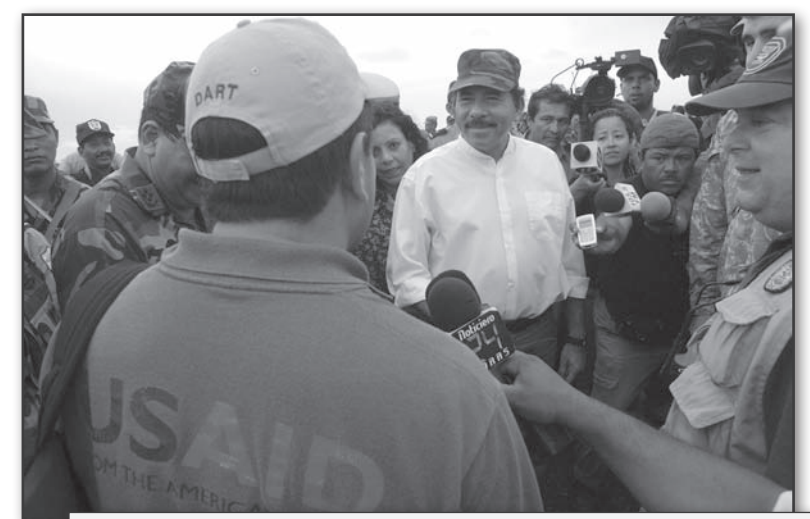
Nicaraguan President Daniel Ortega welcomes USAID OFDA representatives and US Service Members following hurricane relief efforts.

USS KEARSARGE (LHD 3), completed the Atlantic Phase in November, and its joint, international, and nongovernmental medical professionals worked alongside host nation officials to treat more than 145,000 patients in six countries. The crew also dispensed more than 81,000 prescriptions, provided veterinary care to nearly 5,600 animals, and completed