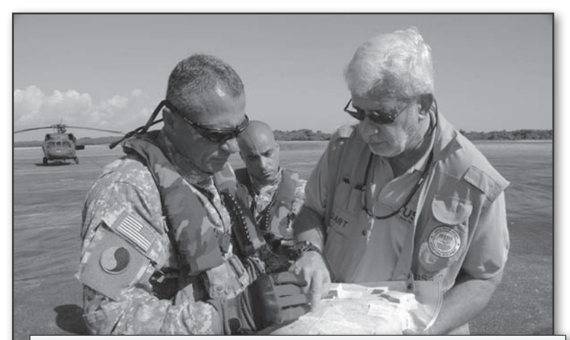
Southern Command Service member takes direction from USAID representative on where food rations and water need to be delivered.

complements our humanitarian and civic assistance programs, as well as our engineering training exercises. Overall, Continuing Promise 2008 was an incredibly successful mission that further advanced our strategic messaging and built confidence, capability, and goodwill in numerous countries in the region serving as a visible and lasting counterweight to anti-U.S. messaging.