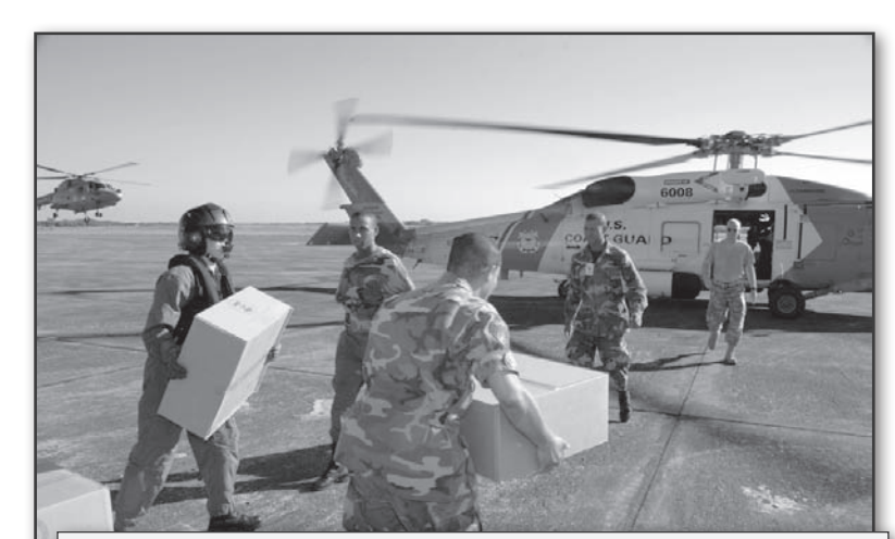
Helping Dominican Republic Service Members load food and supplies for distribution to isolated communities after a tropical storm

One of the ships, USS BOXER (LHD 4), completed the Pacific phase of Continuing Promise with superb results: over 65,000 total patient treatments, including 127 surgeries, 4,000 optometry patients treated, 14,000 dental procedures, medical and military training for thousands of hostnation students, and construction projects at almost a dozen sites. The second ship,