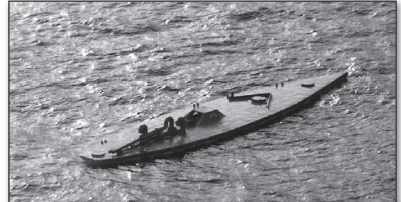
A self-propelled semi-submersible craft seized Sept. 16, 2008 in the Eastern Pacific Ocean. The vessel can travel from Ecuador to San Diego, Calif., without having to stop for replenishment.

USS McINERNEY was one of several assets – air, land, sea, and space – that were coupled with interagency operatives and partner nation agents throughout the hemisphere and Europe who were "on duty." In our JIATF-S headquarters in Key West, 24/7 operators were fusing