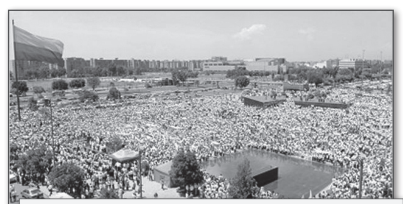
Bogotá, 4 Feb 2008: Mass demonstrations by over 5 million Colombians against the FARC and for the freedom of the more than 3,000 hostages held by the guerilla organization.

Since the United States and Colombia started working together to help secure peace,