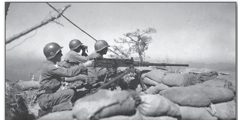
Colombian army units deployed in support of US/UN forces during the Korean War

Historically, we have had very close military ties with our partners in the region. For example, Brazil fought with us during World War II – The Brazilian Expeditionary Force, numbering over 25,000 troops, fought with U.S. forces in Italy