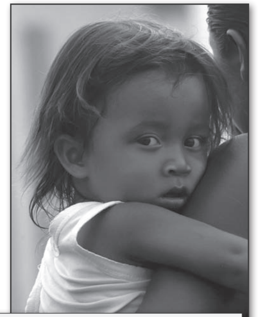
A Nicaraguan child and her mother await delivery of food and water from the U.S. Navy in the wake of a hurricane.

earning 20 times that of the poorest 20 percent. By comparison, the richest 20 percent in high-income regions of the world earns only 7.7 times that of the poorest group.<sup>5</sup> The cumulative effect of poverty and income inequality in Latin America and the Caribbean serves as a catalyst for insecurity and instability. Although these figures vary from country to country in the aggregate, poverty and inequality make whole regional populations vulnerable to the influence of illicit activity – such as drugs, crime, gangs, and illegal immigration.