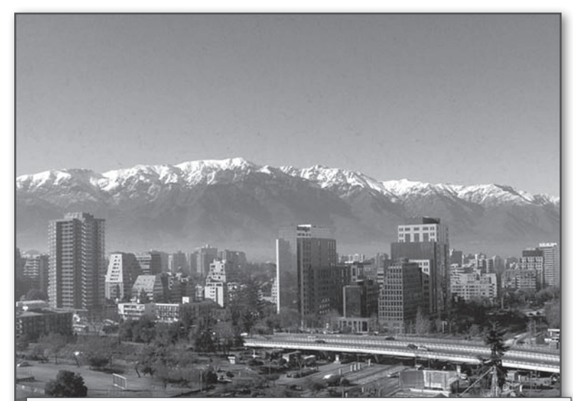
Modern Santiago de Chile with the Andes Mountains as a background.

The economies in Latin America and the Caribbean are increasingly tied with the global economy – with very close linkages to the U.S. Now, Latin American economies are beginning to