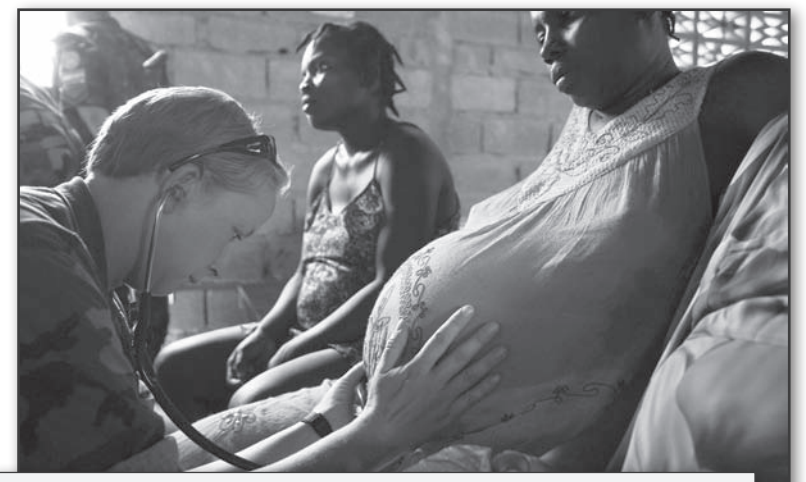
A medical augmentee embarked aboard USS KEARSARGE, listens for the heartbeat of a village woman's unborn child during a health assessment visit.

"I was particularly proud to see the involvement of Southcom through the relief efforts on the USS KEARSARGE. The USS KEARSARGE has provided assistance on medical and engineering projects, as well as the continued logistical support to remote areas of Haiti that were heavily damaged by the recent tropical storms. This kind of support is invaluable due to the extreme difficulty in providing these coordination efforts." — Rep. Kendrick Meek from his statement for the hearing before the Foreign Affairs Subcommittee on the Western Hemisphere on Haiti Hurricane Relief Efforts, September 23, 2008.